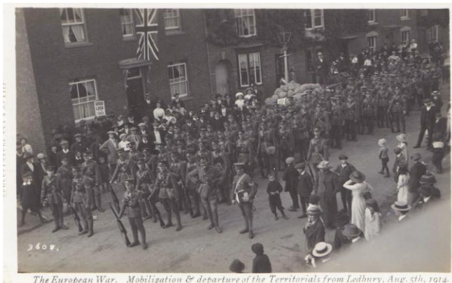
Members of the Herefordshire Regiment, on Mobilisation 5 August 1914 in New Street Ledbury.

It is planned to retell the experiences of the Regiment during World War One by publishing a monthly account on the Museum's website; this will be based around the Battalion War Diaries. It will start publication in July 2014.