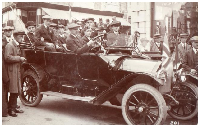
Volunteers for The Herefordshire Regiment prepare to leave Llandrindod Wells to 'join up' at Hereford.