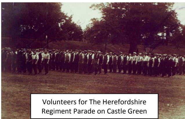
Volunteers for The Herefordshire Regiment Parade on Castle Green