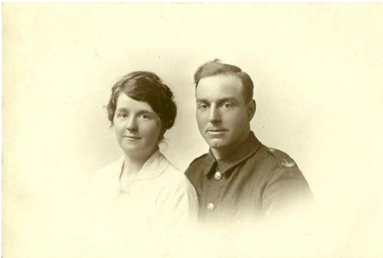
An unknown Herefordshire soldier with his wife(?)

During their leave many soldiers would have taken the opportunity to have their photograph taken to give to their mother, sister wife or sweetheart.