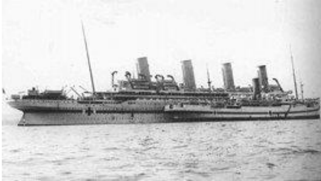
HS Britannic with HS Galeka alongside