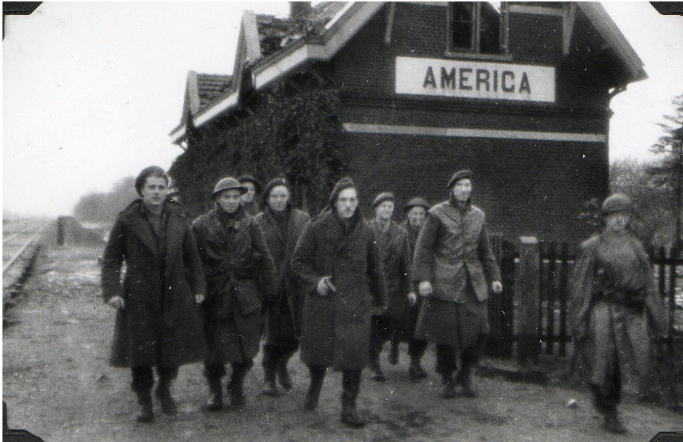
Members of the Herefordshire Regiment at Amerika Station.

Operations in November continued to concentrate on the elimination of the Maas pocket and the opening up of Antwerp. The ground made tank warfare difficult and the majority of effort fell to the infantry. 159 Bde's objective was the town of Amerika. The town was carried and the Battalion settled down on the banks of the Maas.