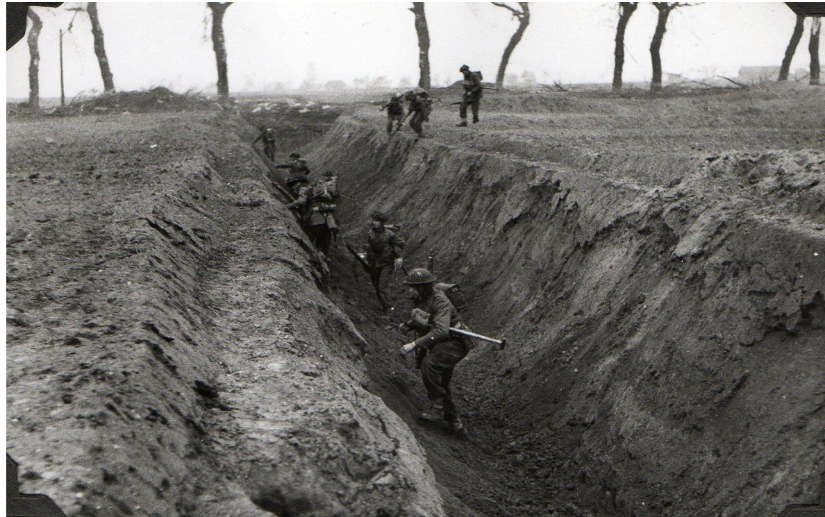
Crossing the anti tank ditch which surrounded Udem.

Further advances met strong and determined opposition but pressed on.