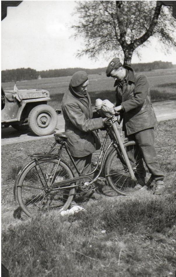
Soldiers examine a captured 'Panzerfaust'.