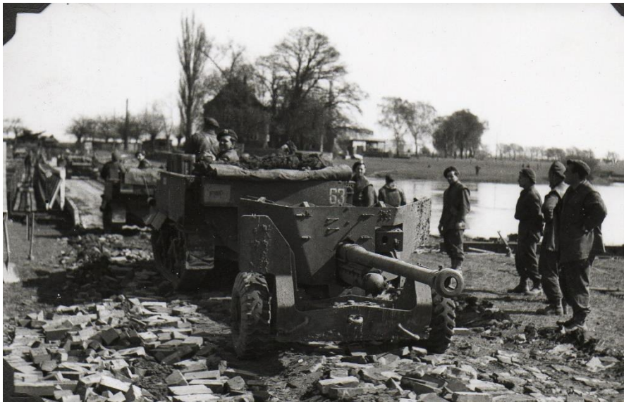
The Weser crossing at Petershagen

The advance continued and on 30 th crossed the River Elbe.