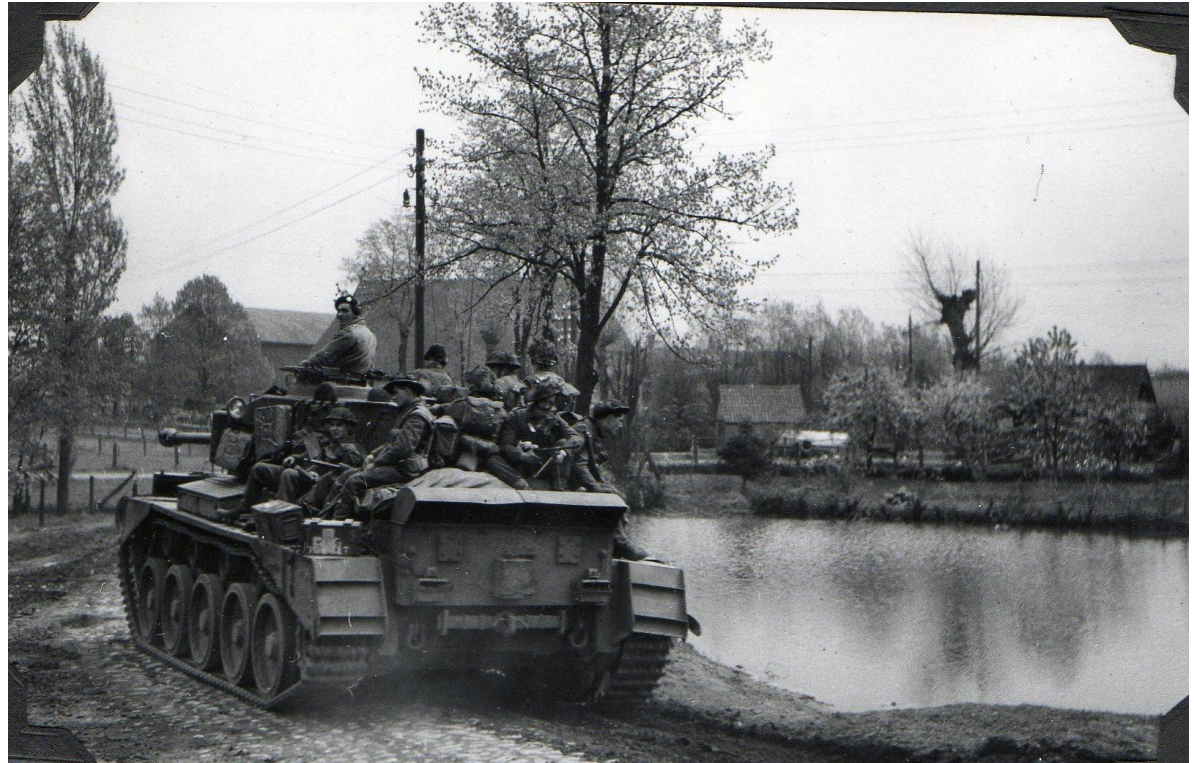
The Herefords move forward on the rear of a Fife & Forfar Yeomanry Comet tank.