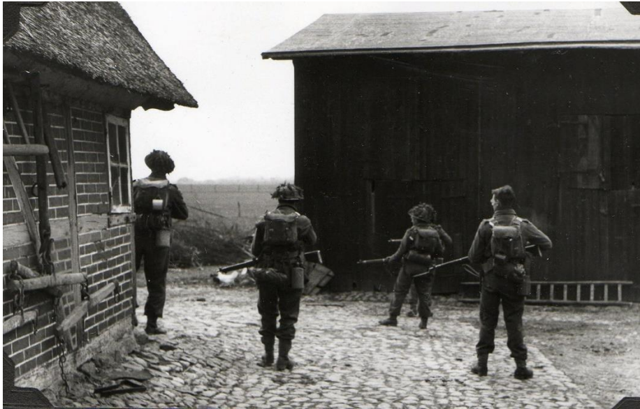
Rounding up German soldiers