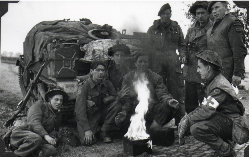
A 'brew up' on the Lubeck road.

After crossing the Elbe the advance continued towards Lubeck on the Baltic coast. It was soon realised that German resistance had collapsed and thousands of prisoners were surrendering every day. PoW concentration areas, guards, admin support and interrogation all had to be completed. There were also considerable civilian issues to deal with.