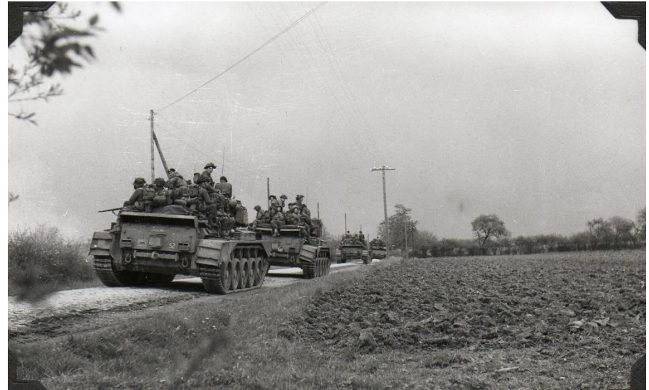
The advance to Lubeck