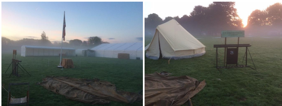
At the start of the day!