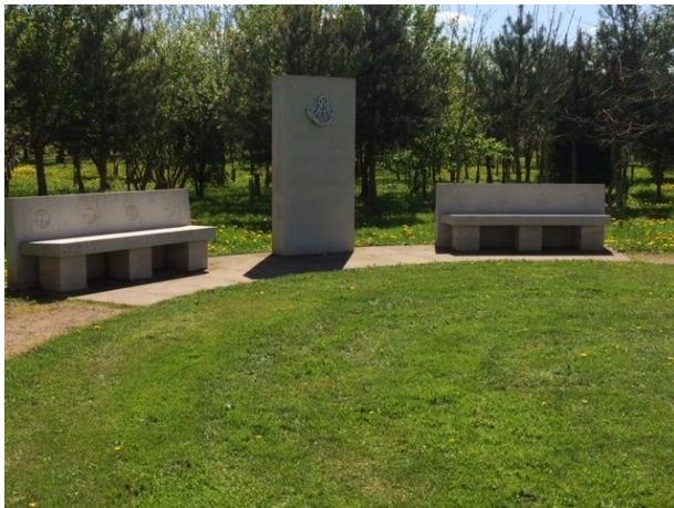
The Light Infantry Plot at The National Arboretum