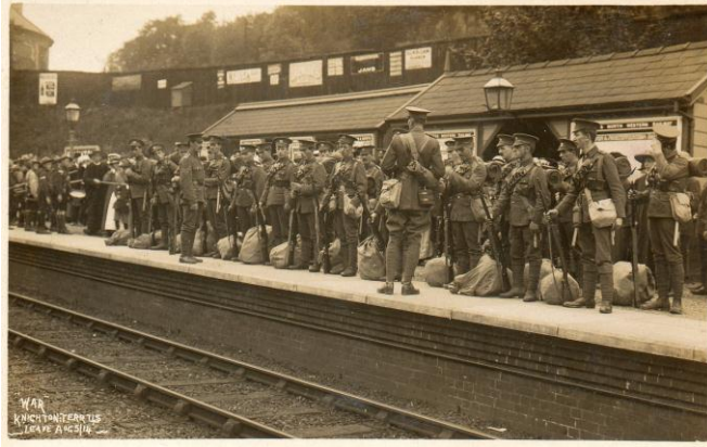
Members of the Herefordshire Regiment, on Mobilisation 5 August 1914 at Knighton Station.

World War One Outbreak - Centenary Commemorations: Whilst national and local plans are forming, the Museum is keen to take a full part in local activities and to ensure the actions of the Herefordshire Regiment and its members are suitably acknowledged. The Museum and Friends' Committees are fully involved and would be pleased to hear from any members who have any details/accounts/photographs of those times and individuals of August 1914 – especially photographs of mobilisation and 'volunteers'.