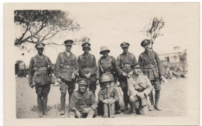
C Coy Foot Inspection