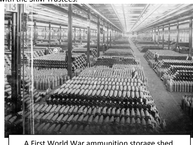
A First World War ammunition storage shed. Rotherwas Ammunition Factory

It is hoped that the Project will reach fruition before the centenary of the Armistice of the First World War in 2018. This time will be used by the Museum to make sure its collections and their management are able to be transferred to the new centre. It is, at this early stage planned that ownership of the Museum's artefacts will remain with the Trustees but their day to day management will lie with the Heritage centre – this will in many ways be a similar model to the Shropshire Regimental Museum in the Castle at Shrewsbury, and our Trustees are in contact with the SRM Trustees.