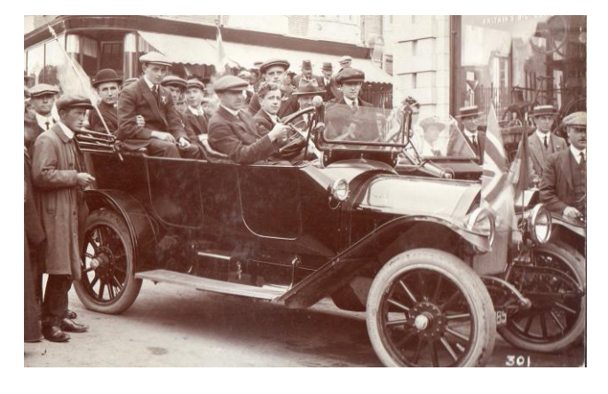
Volunteers for The Herefordshire Regiment prepare to leave Llandrindod Wells to 'join up' at Hereford.