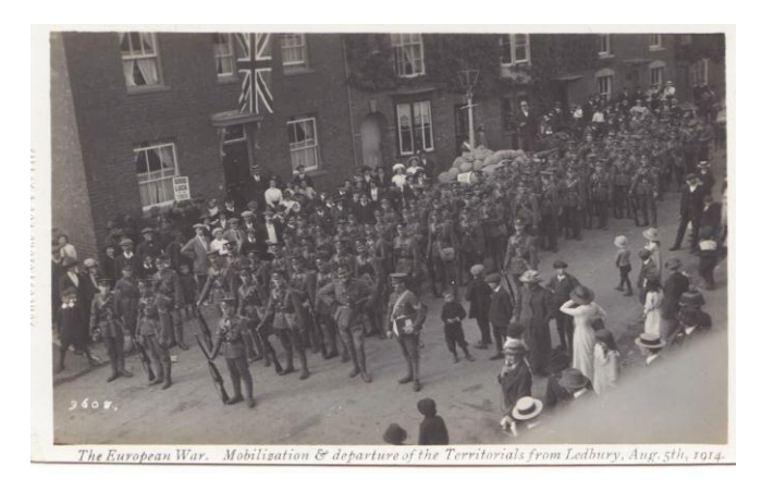
Members of the Herefordshire Regiment, on Mobilisation 5 August 1914 in New Street Ledbury.

It is planned to retell the experiences of the Regiment during World War One by publishing a monthly account on the Museum's website; this will be based around the Battalion War Diaries. It will start publication in July 2014.