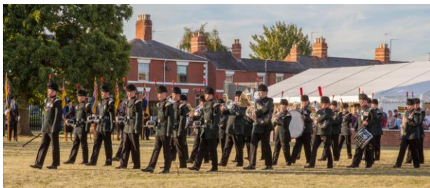
The Salamanca Band of The Rifles March On