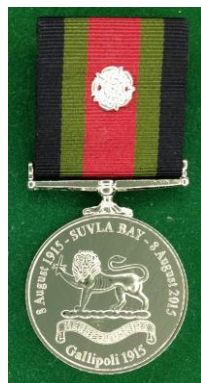
The Herefordshire Regiment Suvla 100 Commemorative Medal