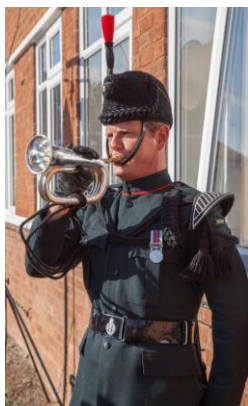
The Bugler prepares to sound No More Parades Today