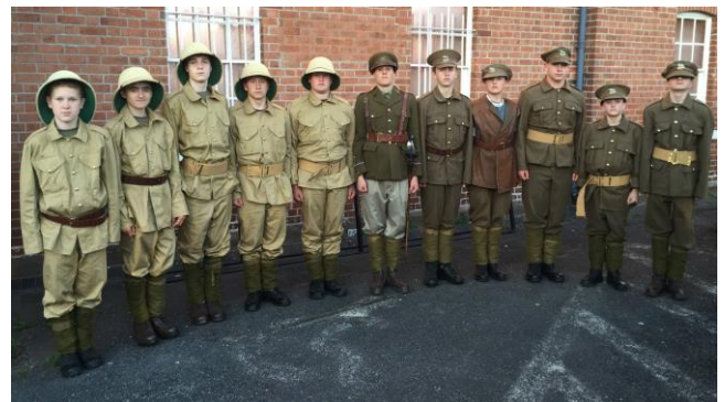
Cadets of C (Rifles) Coy HWACF, in period uniform