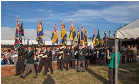
The County Standards March On for the Sounding of Retreat