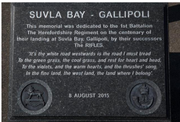
The Commemorative plaque