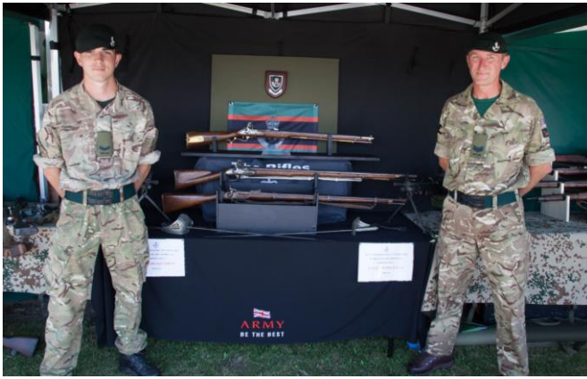
Ancient & Modern – the weapons of The Rifles