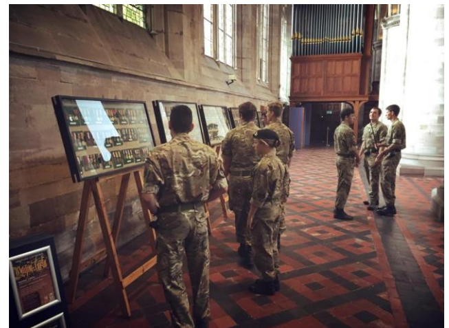
The Suvla100 Medal Display in the Cathedral