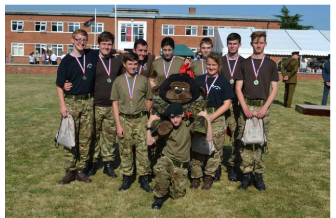
C (Rifles) Coy HWACF, winners of the Herefordshire Cadet Tug of War competition