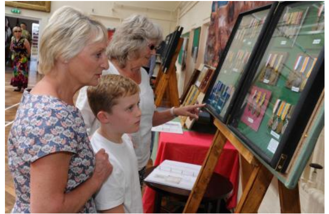
Viewing the Suvla 100 Medal display