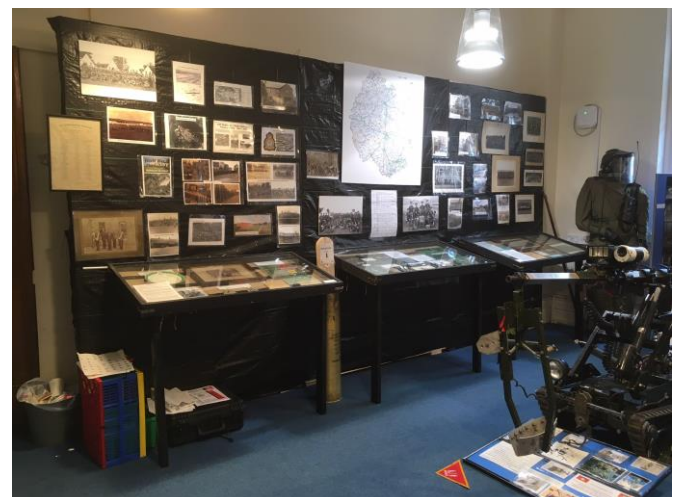
The Military display at The Town Hall