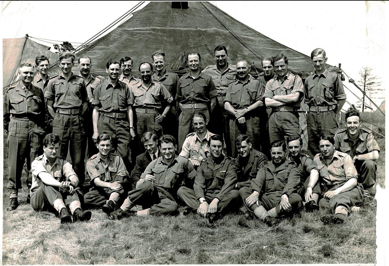
The Officers Mess at Annual Camp (late 1950s/early 1960s):