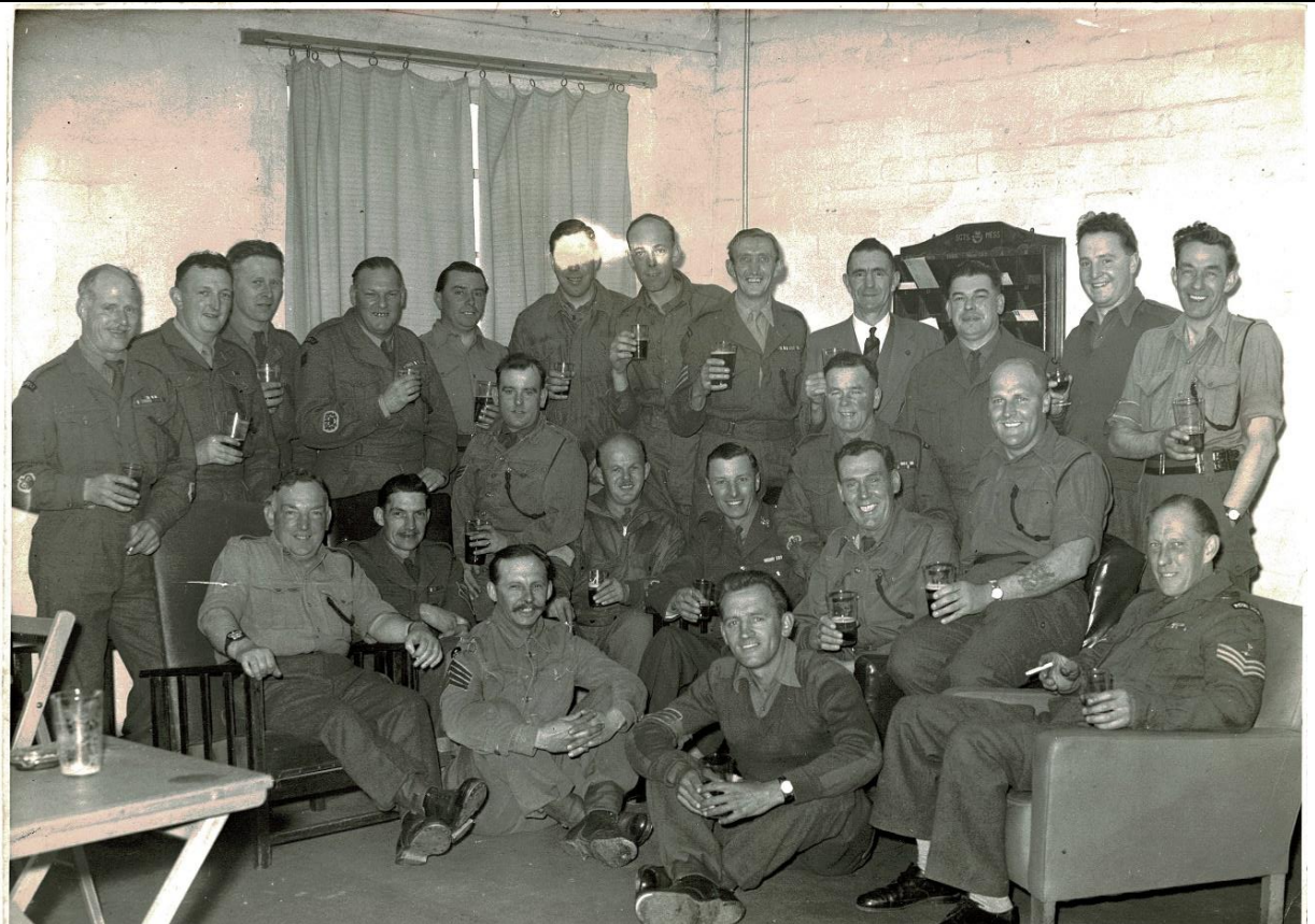
The Sergeants Mess at Annual Camp (Plaisterdown 1962):