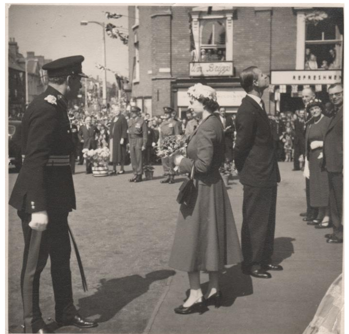
Her Majesty visiting Ledbury in 1957, with 2 unidentified officers of the Herefordshire Light Infantry in the background.